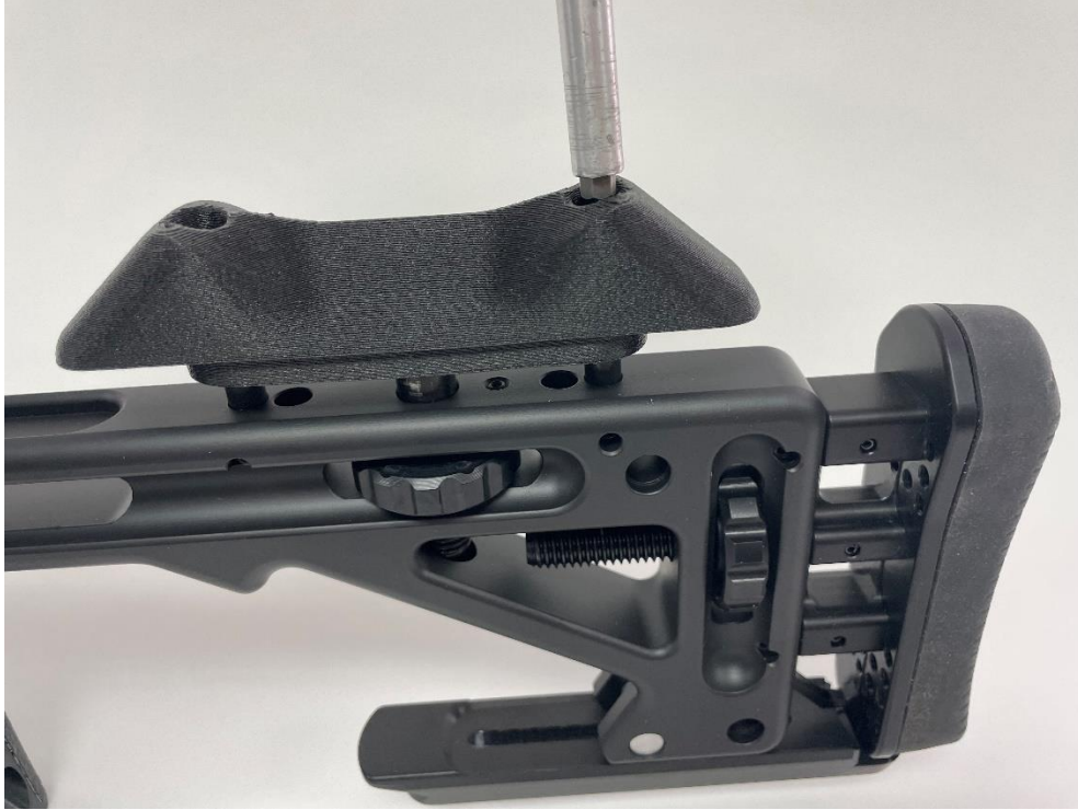
Picture of Hybrid Chassis with Bison Tactical MPA Competition Cheekpiece assembled

**CAUTION- do not overtighten. Snug is good enough **